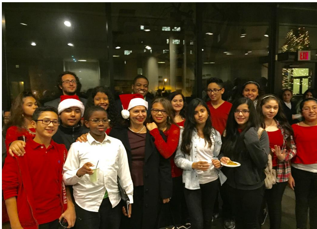
"CHILDREN COME FIRST, LOS NIÑOS SON PRIMERO"